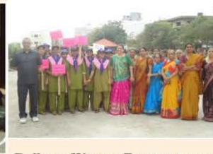
Rally on Women Empowerment