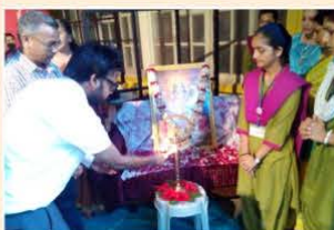
KCG Team Visit