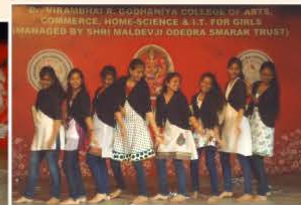
Dance Performance on Talent Day