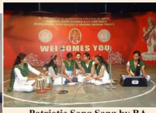
Patriotic Song Sang by BA Students on 15 th Aug.