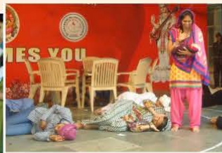
Drama on Beti Bachavo