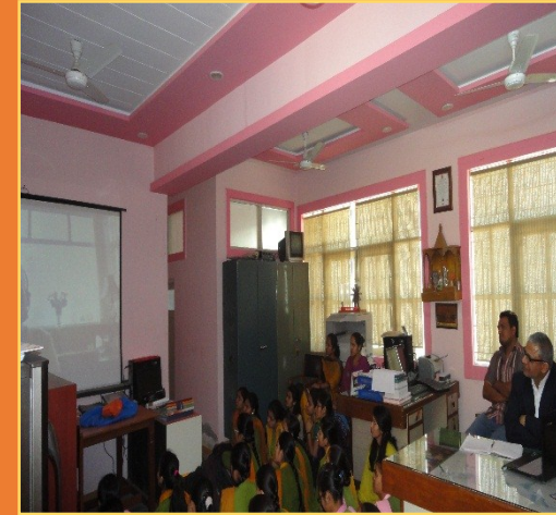
Online Skype lecture from the U.K.