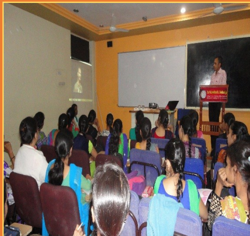
Guest Lecture in M.A