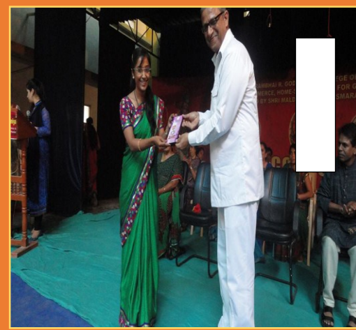
Teacher's Day celebration