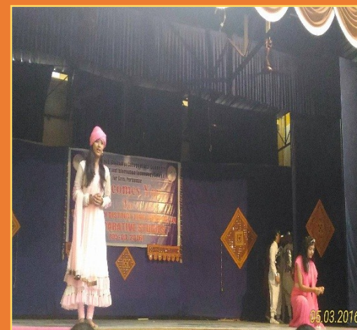
Drama on Samson Agonistes by T.Y students