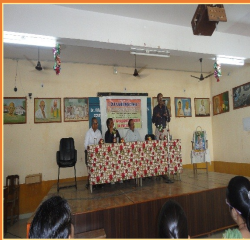
Workshop in PG